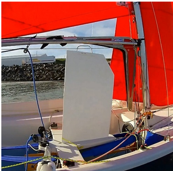
Fig 1 - FANG F2 Device

Question Is the FANG kicking strap permitted on the Mirror Class dinghy as per the following picture?