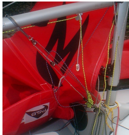
Fig 2 – Conventional Kicker